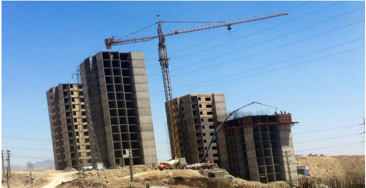
Picture 8 – Pardis 973 residential unit project – 5p3 residential complex (Concreting Process 2014)